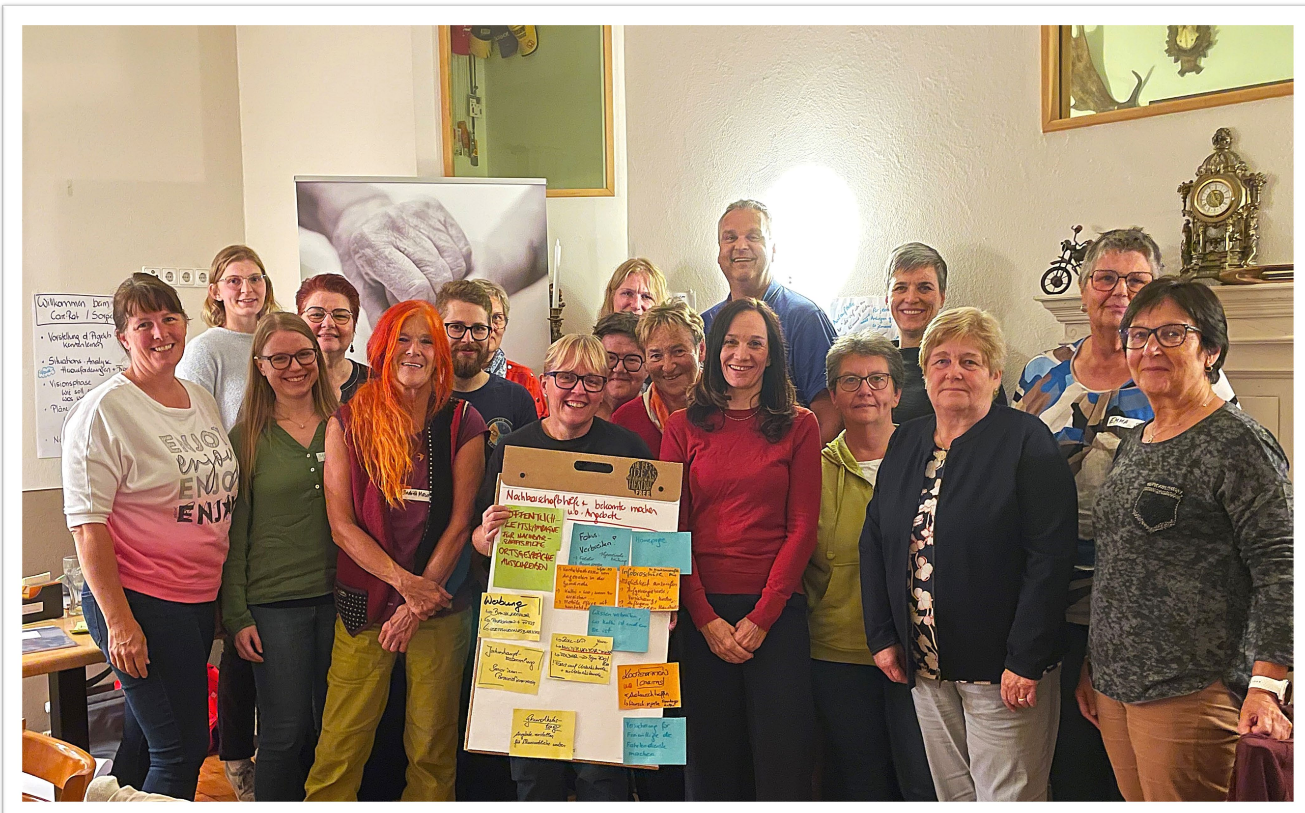
Care-Council Groß-Siegharts, Sept. 2024

Developing sustainable solutions to current care challenges requires collaboration between a diverse range of stakeholders. Care councils are a good way to bring these actors together at a local or regional level to find solutions together. Such actors can include professionals from nursing, social work or other related areas; people in need of support; citizens and local residents or also political decision-makers. Care councils also aim to involve actors whose roles might be less directly related to care – whether these are neighbours, well-connected people within a community or professionals who might not be conventionally thought of as care workers, but who often have privileged insights into local situations due to the work that they do (e.g. hairdressers, bus drivers or teachers). Importantly, care councils seek to include those who might be less visible or who may be harder to reach (e.g. people with migratory backgrounds).